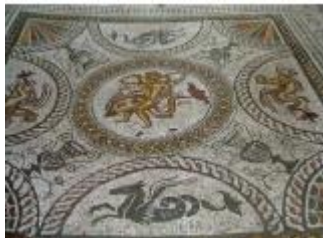
Roman coins have been found in Britain. Here is an