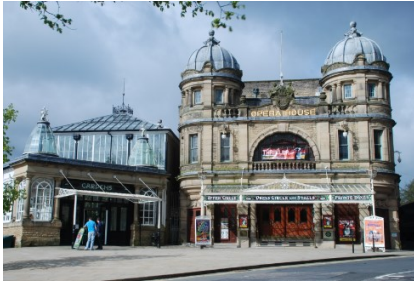
The Opera House