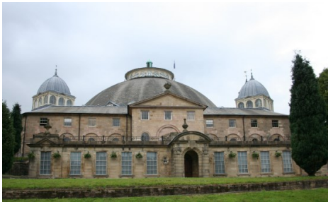
The Devonshire Dome